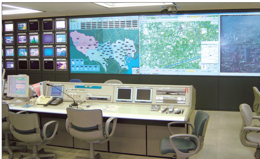
Figure 1. A typical emergency response coordination center (at the Tokyo Metropolitan Government).

agency response center, which, in the event of an emergency, will provide information and support to the public (through emergency phone lines), responders, and decision-making authorities.