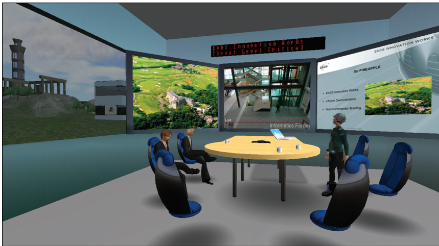
Figure 3. Inside the crisis response virtual operations center (VOC) I-Room. This instrumented meeting room (IMR) lets participants capture, tag, and timestamp audio, video, and other feeds to provide an audit trail for a post-incident review.