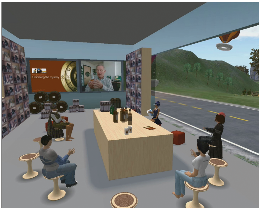
Figure 4. A virtual whisky-tasting I-Room. Participants enjoyed a tutored virtual whisky tasting in the Virtual World of Whisky I-Room.

venue for the 2010 Ryder Cup golf competition. As such, it is currently the focus of real security and safety preparations.