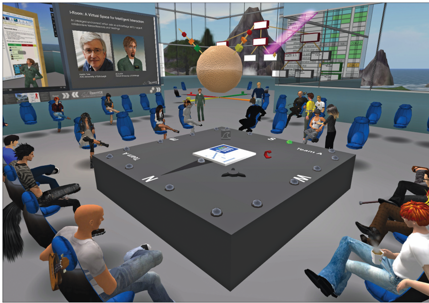
Figure 1. The I-Room is a 3D virtual space for intelligent interaction.

aspects of these spaces in the real world for features that are somehow integral and necessary for collaboration. As a result, we risk replicating these accidental features in a virtual world. However, this must be weighed against the advantage of this approach, namely that the simulation of identifiable real-world spaces