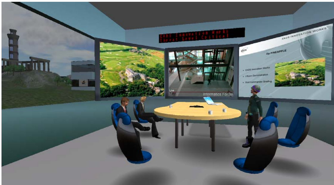
Figure 3. Inside the crisis response virtual operations center (VOC) I-Room. This instrumented meeting room (IMR) lets participants capture, tag, and timestamp audio, video, and other feeds to provide an audit trail for a post-incident review.

Colleagues in this scenario needed to interact in both real and virtual spaces. This, and the importance in such situations of providing an audit trail for post-incident review, led to the deployment of a customized VOC (see Figure 3) mirrored by a real-world briefing room that, in addition to standard communications facilities, was set up as an instrumented meeting room (IMR) that lets participants capture, tag, and timestamp audio, video, and other feeds ( http://www.amiproject.org ).