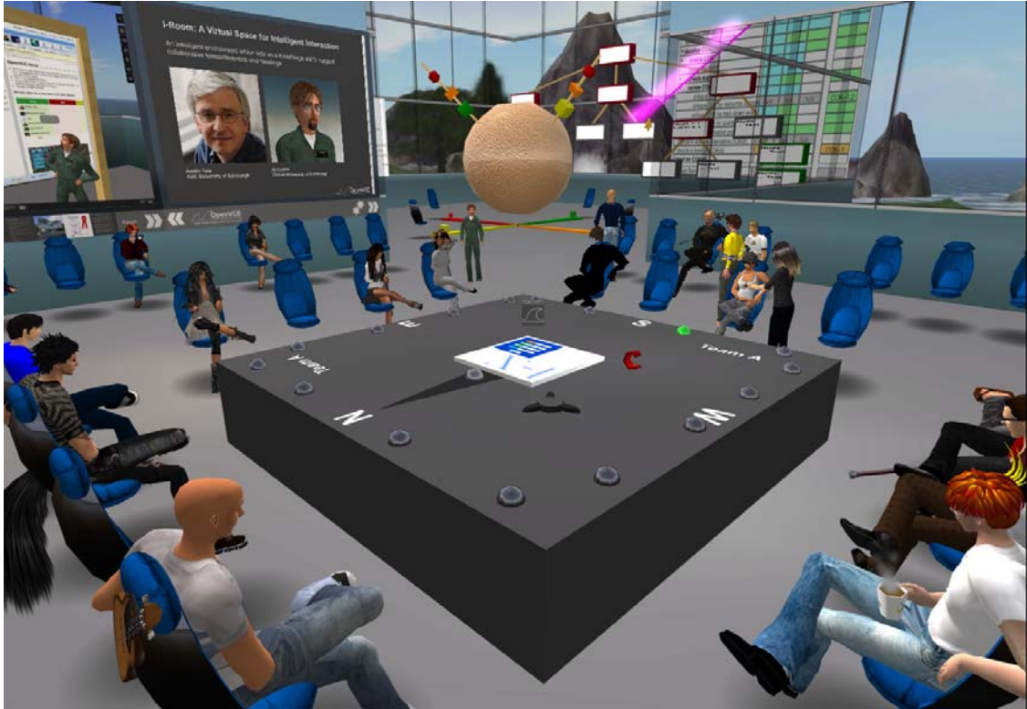
Figure 1. I-Room – a 3D virtual space for intelligent interaction.

With some justification, one could argue that this is not the most effective use of this technology and that it risks mistaking the inessential (and possibly, where collaboration is concerned, detrimental) physical aspects of these spaces in the real world for features that are somehow integral and necessary for collaboration. As a result, we risk replicating these accidental features in a virtual world. However, this must be weighed against the advantage of this approach, namely that the simulation of identifiable real-world spaces offers instant familiarity to users, most of whom have had little prior experience with virtual worlds. As the technology continues to improve and develop, and as our experience with developing and using I-Rooms expands, we expect to be able to hone these ideas into virtual spaces that are optimized for different types of collaboration. (See the “A Brief History of Virtual Collaboration” sidebar for previous work in this area.)