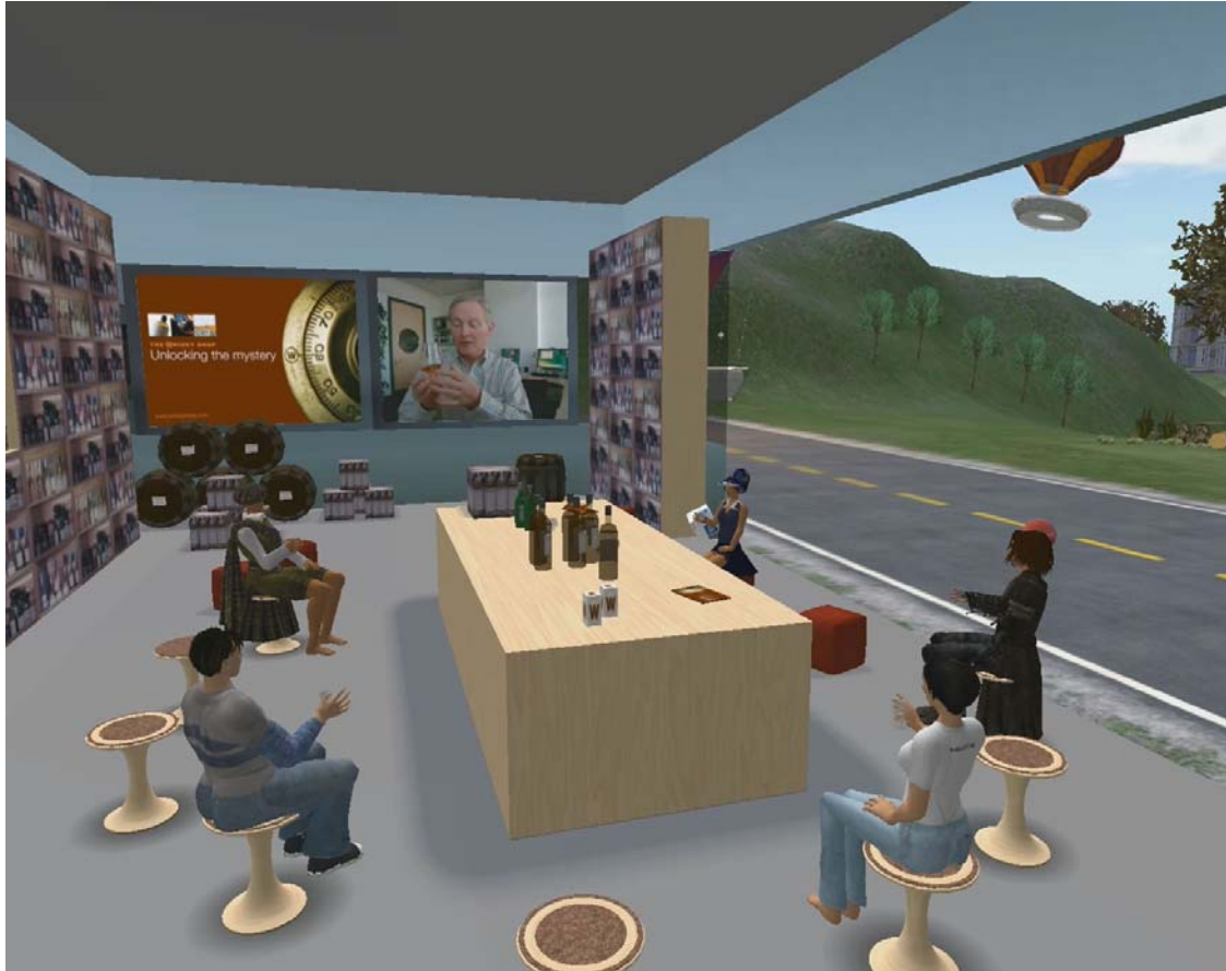
Figure 4. A virtual whisky-tasting I-Room. Participants enjoyed a tutored virtual whisky tasting in the Virtual World of Whisky I-Room.

factual information delivered in a mixed-initiative manner. The success of this event—and the enjoyment it provided—has helped convince those involved of the potential of intelligent virtual world spaces for engaging social users and potential customers.