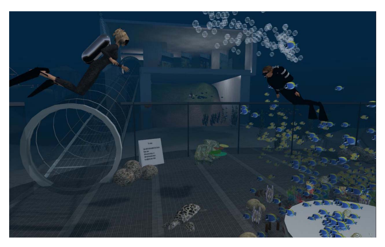
Figure 4: View within the Underwater Level