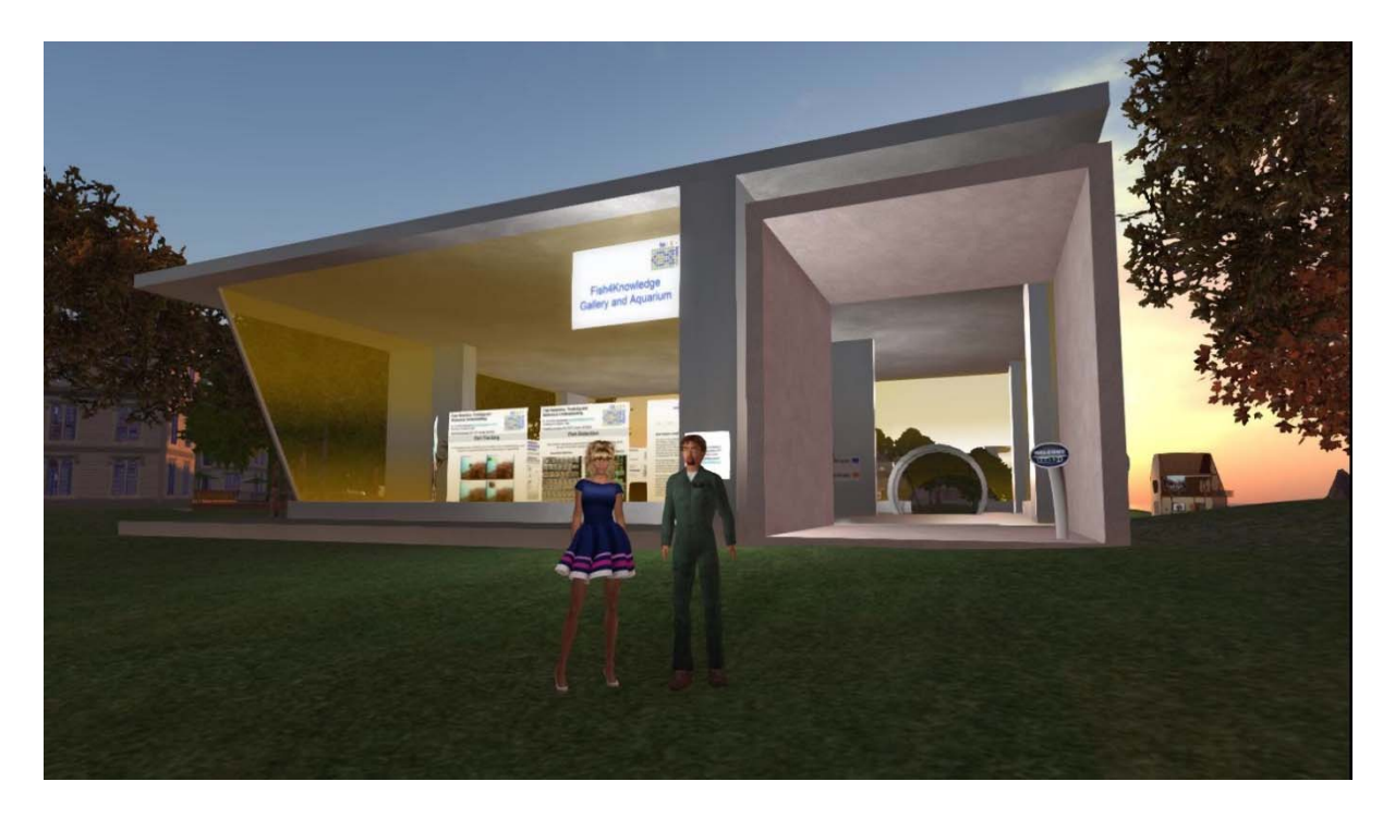
Figure 1: Front of the F4K Virtual World Gallery

The Fish4Knowledge virtual exhibition gallery is situated at a beauty spot by a lagoon at the heart of the Vue virtual world facilities. In this gallery, visitors are able to "walk" leisurely around our virtual building, via their avatars, to read about our project work and watch our underwater fish monitoring movies that were recorded at our observation sites. They are able to learn and be entertained in a beautiful surreal environment where the sunset is reflected by the nearby lagoon shining through the large floor-to-ceiling glass window walls. Alternatively, visitors can choose to visit our gallery on starry nights, or at any other times of the (virtual) day to enjoy the shimming sea waves. Figure 1 shows the front of the F4K virtual gallery.