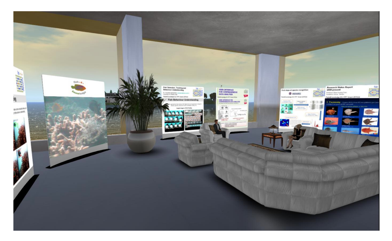
Figure 2: View of the Ground Level Exhibition Hall

On the left hand side of Figure 2, one can see a media screen displaying a looped marine life video that was captured under the coastal sea off the South of Taiwan. This video is an example of the videos that the Fish4Knowledge team process.