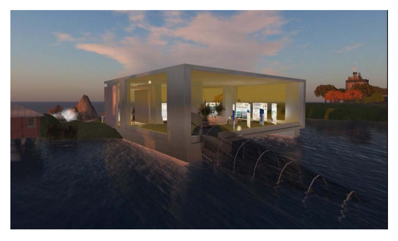
Figure 3: Tunnel to the Underwater Level